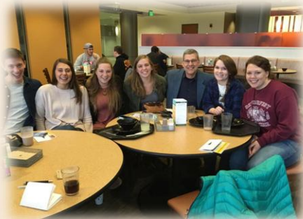
Michigan State University Alumni

Every few years, my work as AYF Associate Director brings me to the Midwest—to visit our partner universities, to meet students and new colleagues, and to develop strategies for strengthening the program.