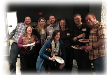
Alumni Social in Chicago in March

Very soon AYFAA is hoping to provide the first round of academic stipends and travel grants to AYFers in Freiburg. And we can use your support! AYFAA is officially recognized by the Internal Revenue Service as a nonprofit charitable organization. All donations—including membership dues—are used for charitable purposes and are tax deductible to the fullest extent allowed by law. If you are not yet a member, please visit www.ayf-alumni.org to join and learn more about the European and U.S. chapter of our organization. All members are invited to attend our events and executive meetings.